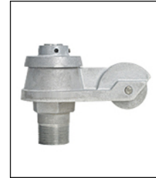
TRK-9420SS-58 HD Rev. Sealed Truck SS Spindle