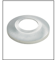
COL1-A12C FC-11 Cast Alum 1-Piece