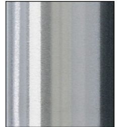
SAT Satin Finish