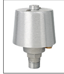
TRK-9650 Int. Revolving Truck Sealed Bearings