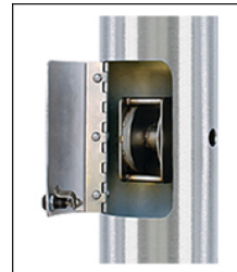
IWW - WINCH Flush Mount Hinged Door