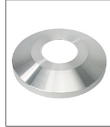
COL1-A07S FC-11 Spun Alum 1-Piece