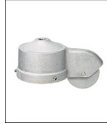
TRK-9301 External Truck Single Stationary