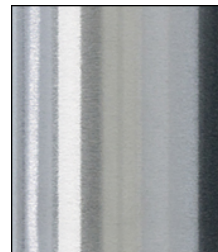
SAT Satin Finish