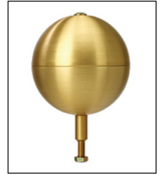
BAL-0812-GLD HD Gold Anodized Aluminum Ball