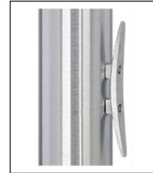
CLA-9090-SAT | 7' from bottom Cleat Only